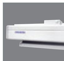
Easy Install with plastic mounting brackets