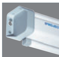
Integrated mounting brackets