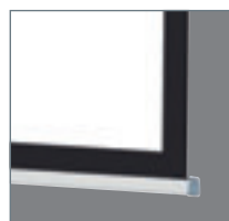
Triangular slat bar