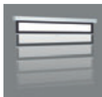
Smooth retraction with CSR